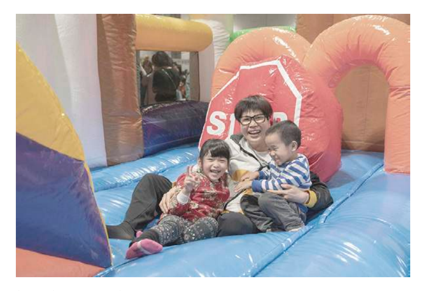
Special Cares Network Carnival in Macao

Families in Mainland China received essential supplies