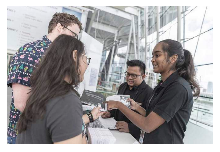
Heartware Network Apprenticeship Program - ArtScience Museum, Singapore

Marina Bay Sands provides opportunities for Singaporean students interested in the hospitality industry through the Heartware Network Apprenticeship Program, which gives youth from low-income families greater exposure to the hospitality industry and helps them gain communication and life skills. In 2019, 15 students from six different schools completed the two-week program with the property's ArtScience Museum and the attractions and retail departments. In addition, the Marina Bay Sands Bursary supported 20 full-time hospitality business students from the Singapore Institute of Technology.