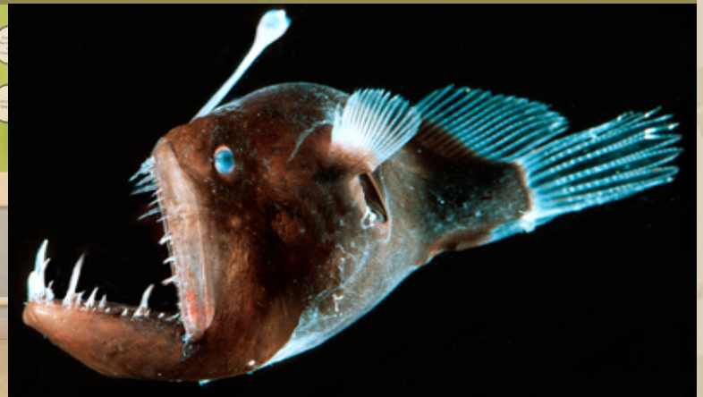
Above: Winner “Angler Fish” by Rise Restaurant