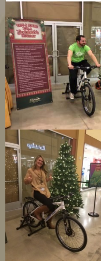
Above: Team Members show their sustainable holiday spirit by peddling to power the Holiday Tree

Sands Bethlehem kicked off the holiday season with their Holiday Tree Lighting ceremony. To share the spirit of sustainability with guests and Team Members, the team set up a holiday booth in the retail outlets. The booth included a banner with green holiday tips like "look for Christmas tree recycling programs in your community" and "avoid plastic shopping bags, pick up some reusable". The team also handed out reusable shopping bags to guests. They even provided entertainment by lighting the tree with electricity generated by a Team Member powered bicycle! Guests and Team Members watched to see if the Team Member "power bike" could keep the tree lit for the entire 2 hour event!