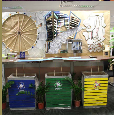
Top: The winning submission from Player Development Bottom: Call Center's submission