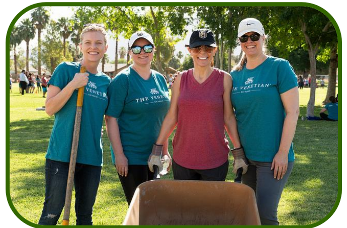
Top Photo: Students selling vegetables at the 2018 Great Garden Build Bottom Photo: The Venetian, The Palazzo, and Sands Expo volunteers