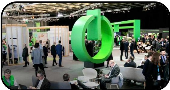
Schneider Electric Innovation Summit

Image via: https://www.schneider-electric.com/en/about-us/events/