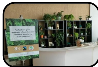
Triple certified sustainable coffee