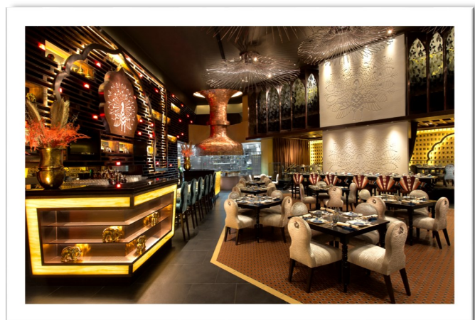
Shown above: Golden Peacock, The Venetian Macao

Check out the videos on National Geographic’s website in the travel section here and here to learn more about