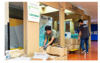
Shown above: Local SME Taion Environmentalist Recycling & Regeneration Factory Ltd. recycling booth