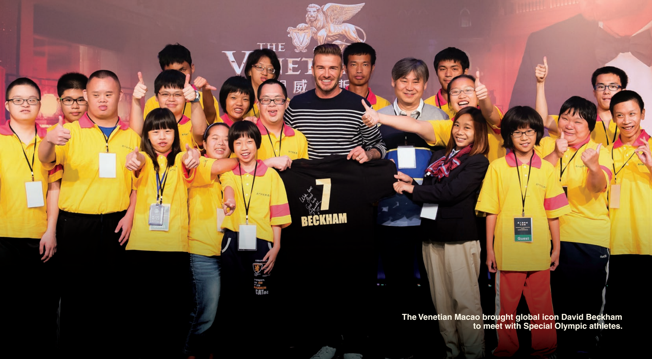
The Venetian Macao brought global icon David Beckham to meet with Special Olympic athletes.