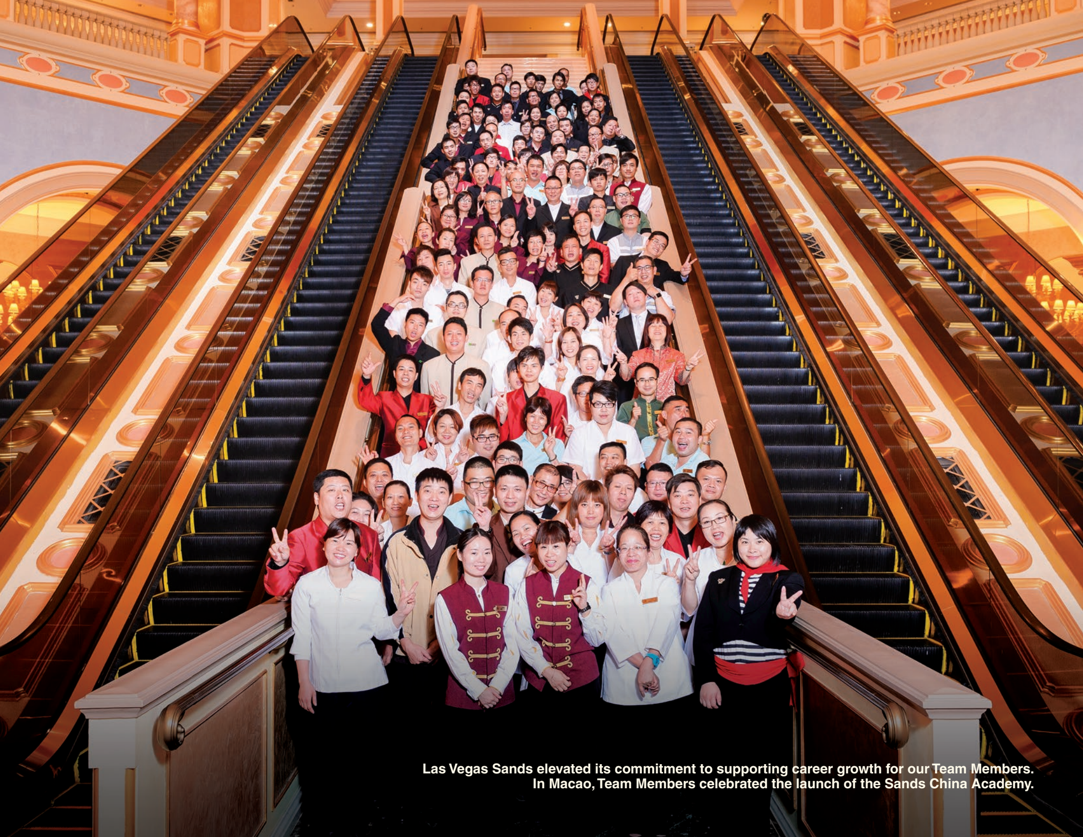
Las Vegas Sands elevated its commitment to supporting career growth for our Team Members. In Macao, Team Members celebrated the launch of the Sands China Academy.