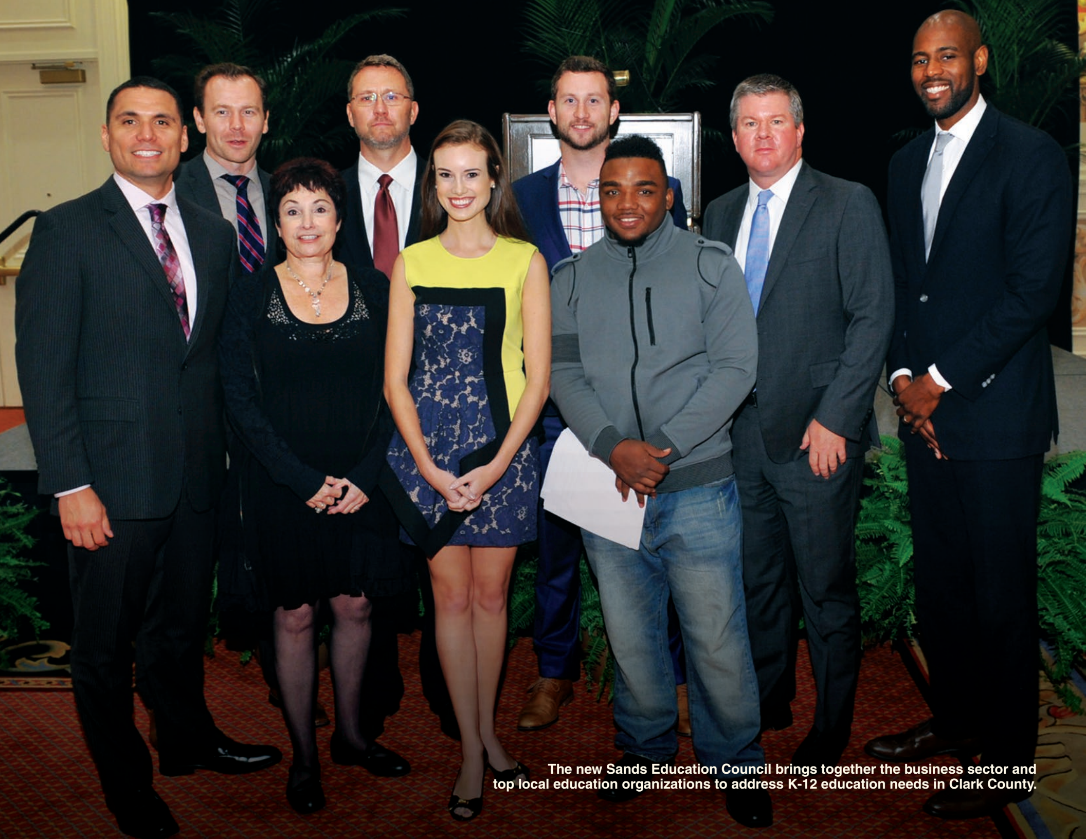
The new Sands Education Council brings together the business sector and top local education organizations to address K-12 education needs in Clark County.