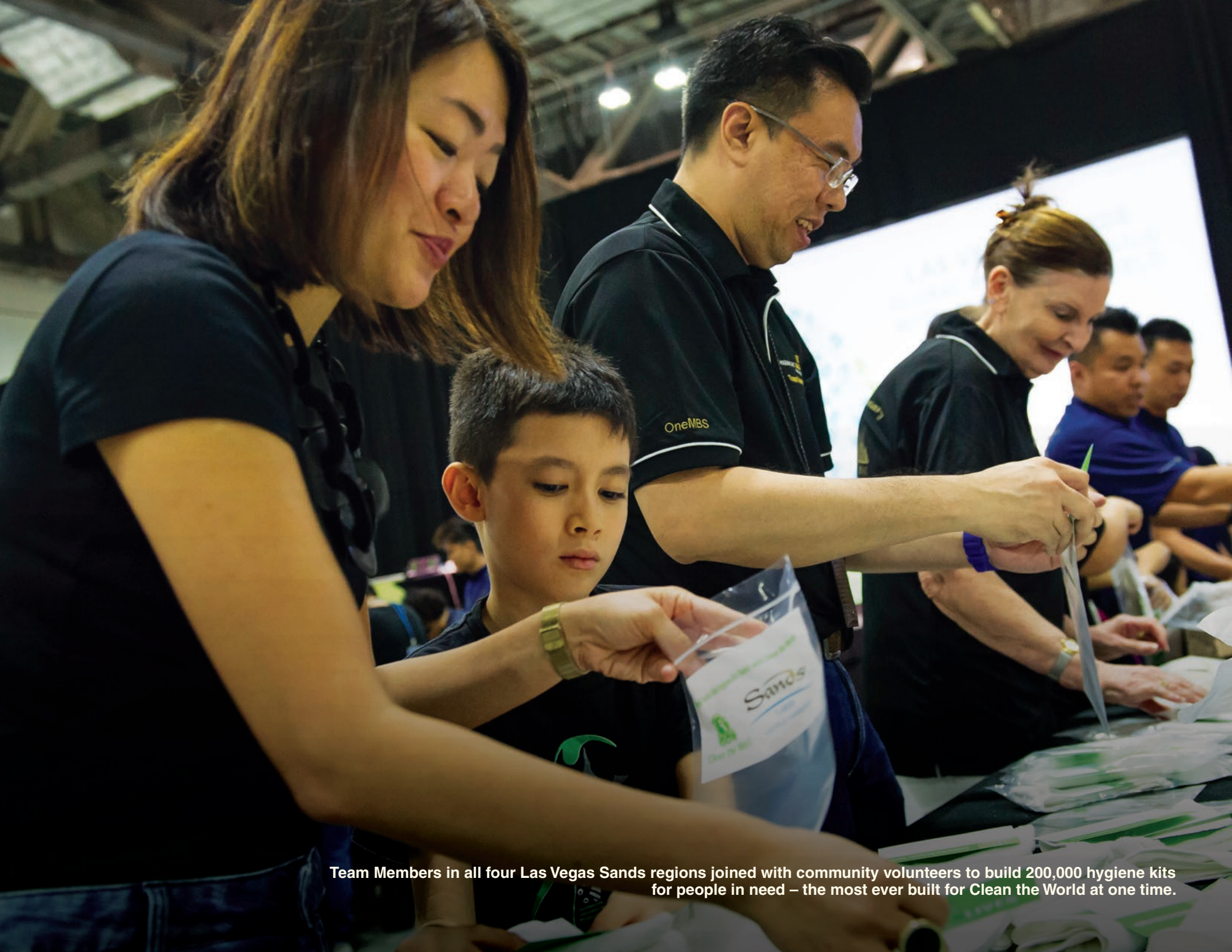
Team Members in all four Las Vegas Sands regions joined with community volunteers to build 200,000 hygiene kits for people in need – the most ever built for Clean the World at one time.