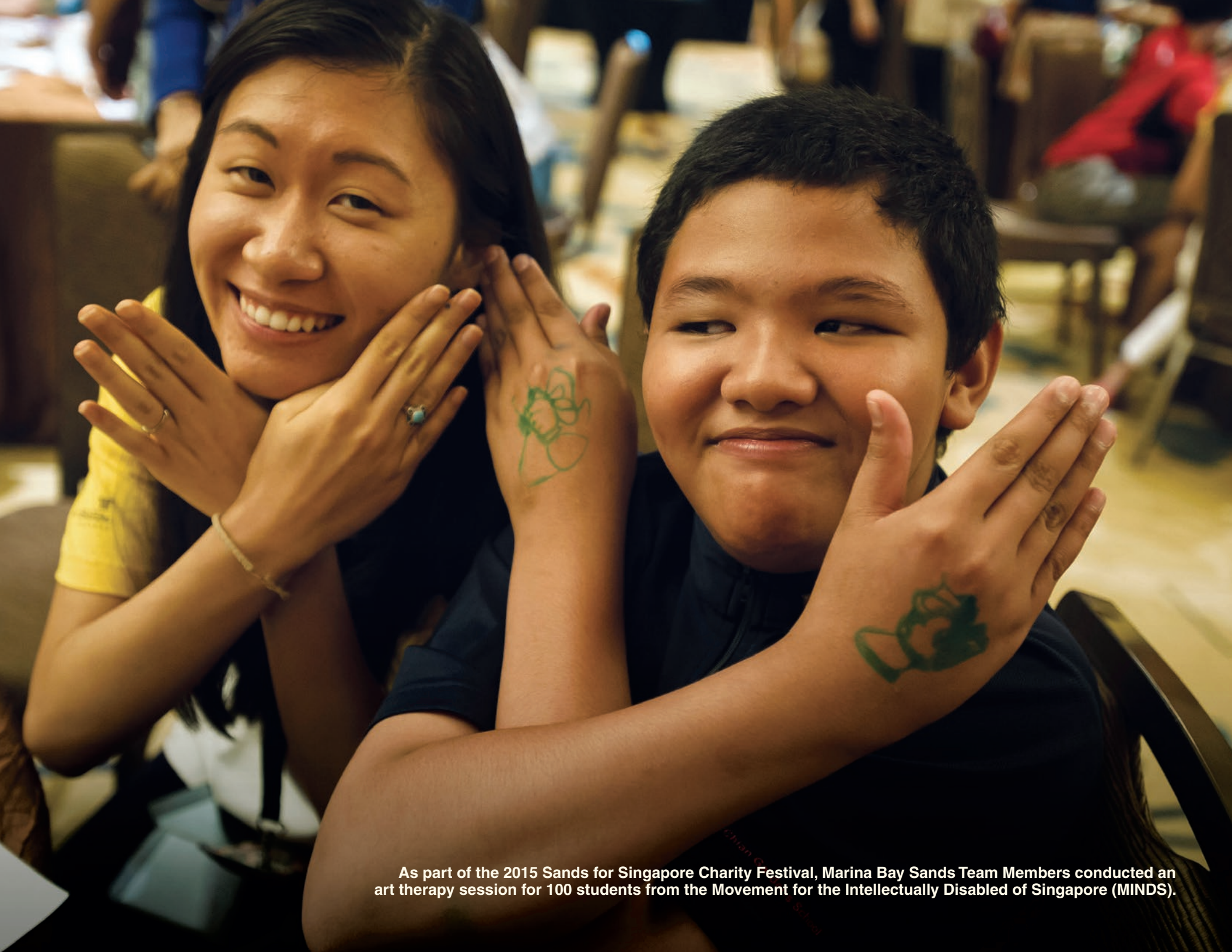
As part of the 2015 Sands for Singapore Charity Festival, Marina Bay Sands Team Members conducted an art therapy session for 100 students from the Movement for the Intellectually Disabled of Singapore (MINDS).