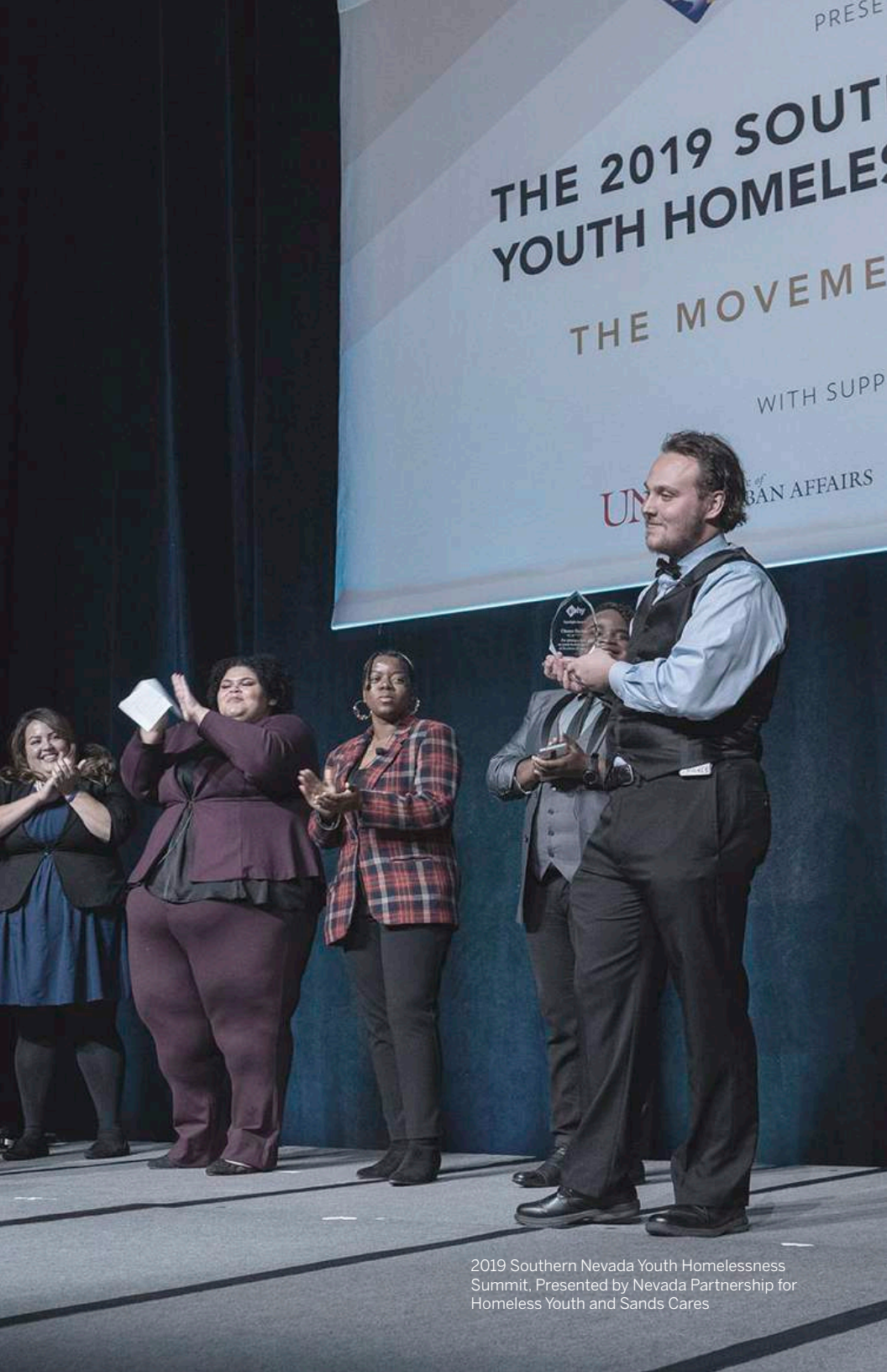
2019 Southern Nevada Youth Homelessness Summit, Presented by Nevada Partnership for Homeless Youth and Sands Cares