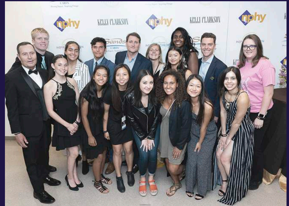
Youth and representatives from the Marty Hennessy Inspiring Children Foundation attend the 2019 Sands Cares INSPIRE Charity Concert, benefiting Sands Cares Accelerator members.