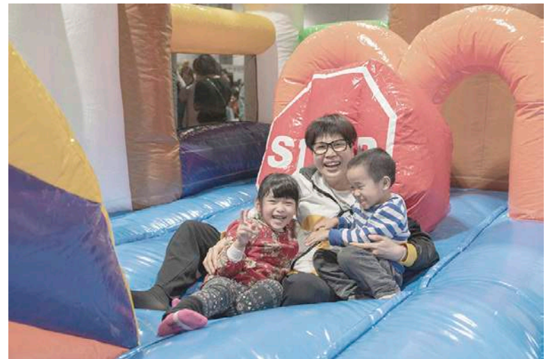
Special Cares Network Carnival in Macao