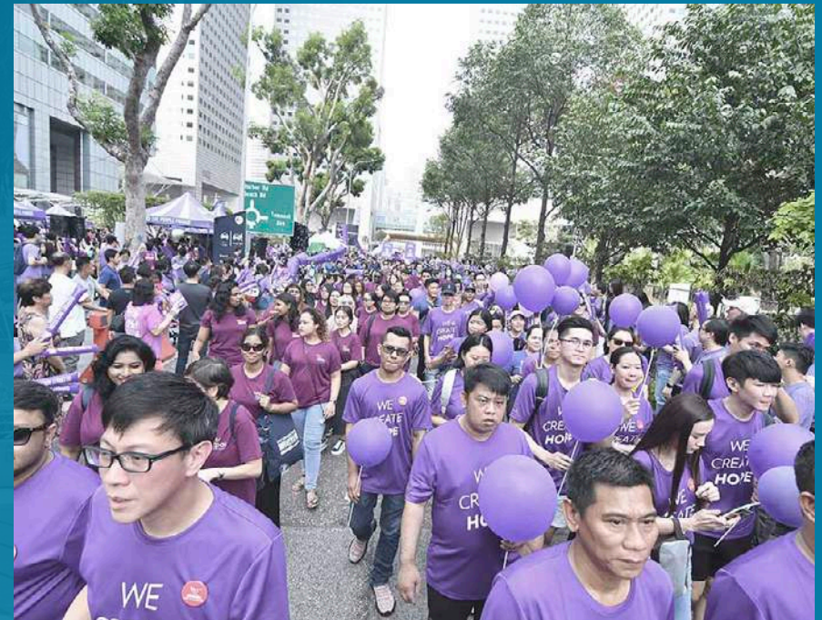
Marina Bay Sands Team Members participate in The Purple Parade, Singapore.

In Las Vegas, The Venetian Resort Las Vegas partners with Nevada Partnership for Homeless Youth on the Young Achievers Externship Program , a one-year, paid internship that is awarded to a Nevada Partnership for Homeless Youth client. The internship includes mentoring, training and development, along with the opportunity for sustained employment after the internship concludes. Marina Bay Sands organizes the annual Sands for Singapore Career Kickstarter program, with the goal of inspiring youth to overcome their perceived limitations and expose them to the different career options available at an Integrated Resort. In 2019, the resort hosted more than 60 youth for a day of tailored workshops, educational tours and dialogue sessions with teams from marketing and hotel operations.