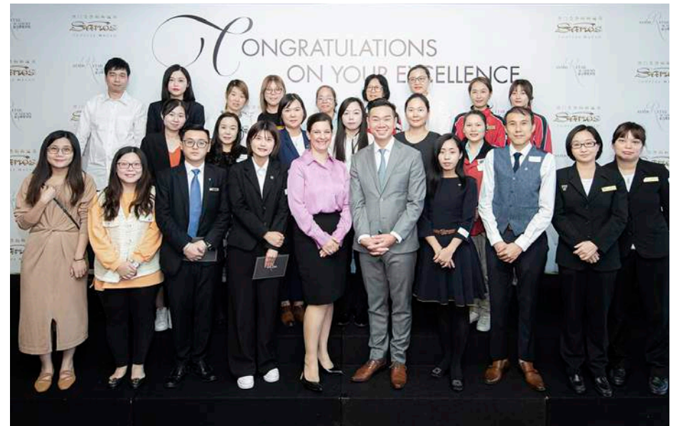
Sands Retail Academy - Sands Shoppes Macao

Sands Academy provides innovative learning and consulting solutions that enable the company to execute its business strategy, while fostering personal and professional growth for Team Members. Our ultimate goal is to be the employer of choice for talent all over the world.