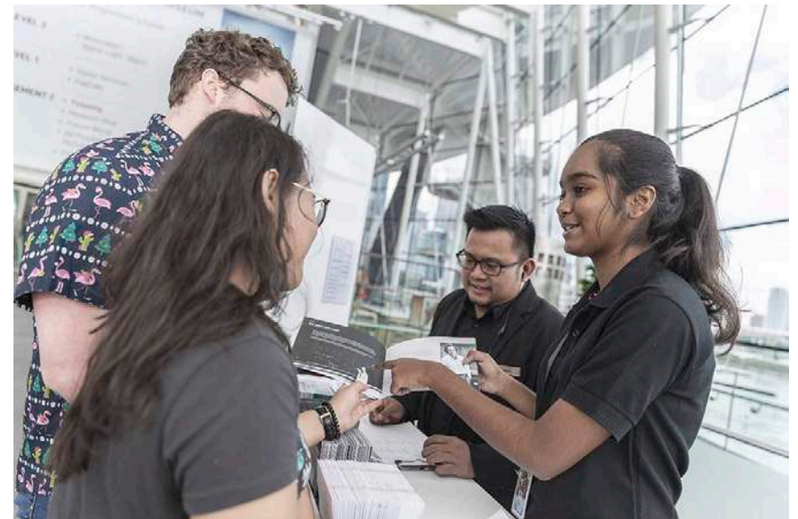
Heartware Network Apprenticeship Program - ArtScience Museum, Singapore

Marina Bay Sands provides opportunities for Singaporean students interested in the hospitality industry through the Heartware Network Apprenticeship Program, which gives youth from low-income families greater exposure to the hospitality industry and helps them gain communication and life skills. In 2019, 15 students from six different schools completed the two-week program with the property's ArtScience Museum and the attractions and retail departments. In addition, the Marina Bay Sands Bursary supported 20 full-time hospitality business students from the Singapore Institute of Technology.