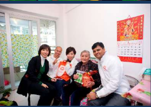
Top: Recycling soap with Clean the World Bottom: Bringing gift baskets to the elderly at the Community Service Center

A group of Sands China Care Ambassadors partnered with Clean the World and the Family and Integrated Community Service Center of Seac Pai Van of the General Union of Neighborhood Associations of Macao in the hope of achieving a positive impact on their community. The main goal was to make gift packs for elderly community residents who live alone in the neighborhood.