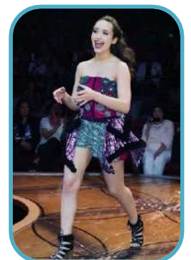
Winner of the couture category on The Palazzo runway

Fashion Forward is a unique Las Vegas student design challenge modeled after the popular TV show, Project Runway . The annual event aims to enhance the education of local design and fashion students and give aspiring designers the opportunity to showcase their creations in a public setting. This year the event was held in The Palazzo Theatre. The lead organizer, Junior League of Las Vegas, used proceeds from the show to support causes including Girl Scouts, Immunize Nevada, Shannon West Homeless Youth Center and more. During the event, the Sands ECO360 team carried out green initiatives to make the show sustainable including setting up recycling stations, reducing food waste, using compostable utensils, and going 100% paper-less, straw-less, and plastic bottle-less.