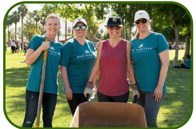
Top Photo: Students selling vegetables at the 2018 Great Garden Build Bottom Photo: The Venetian, The Palazzo, and Sands Expo volunteers