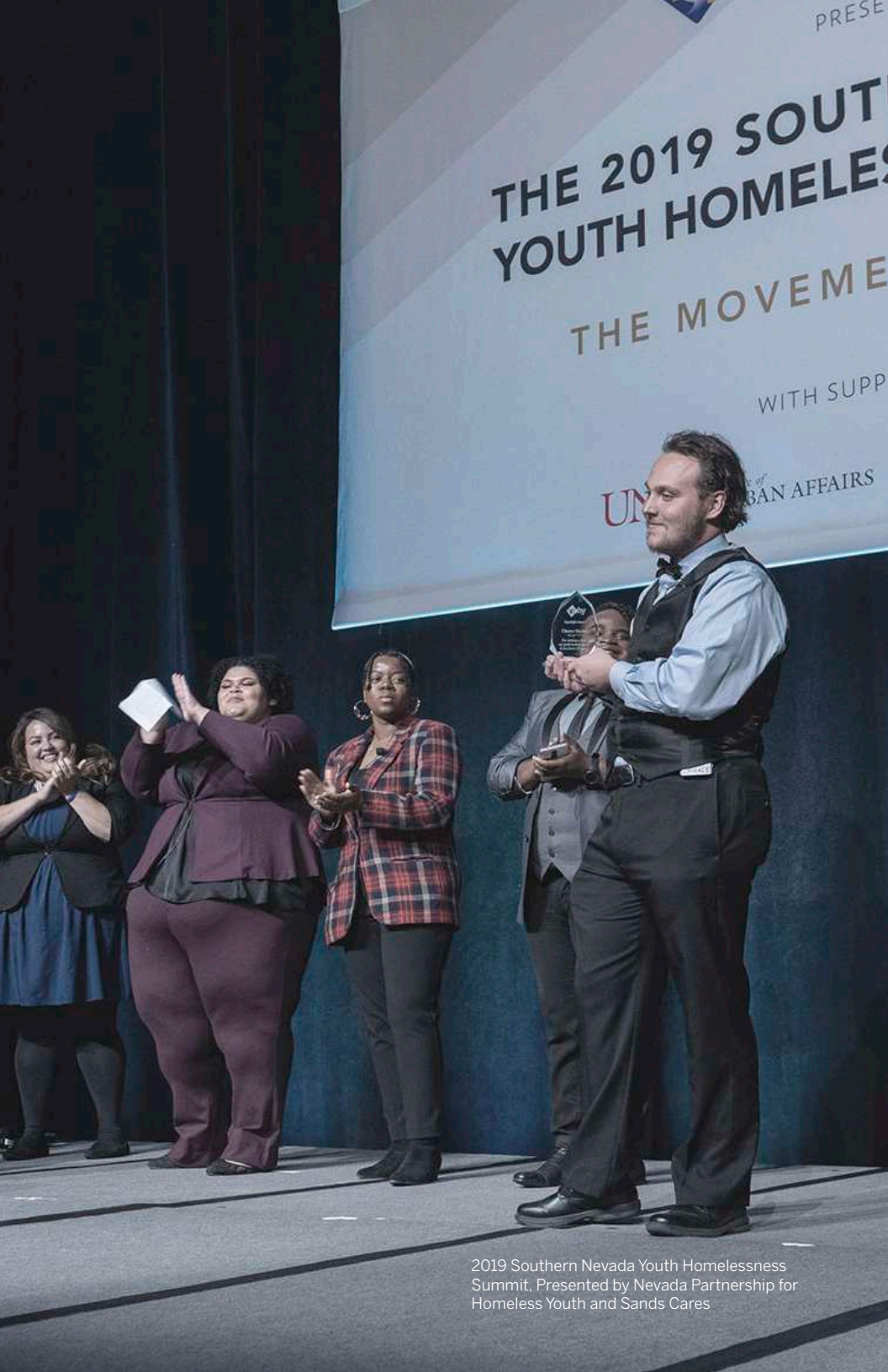
2019 Southern Nevada Youth Homelessness Summit, Presented by Nevada Partnership for Homeless Youth and Sands Cares