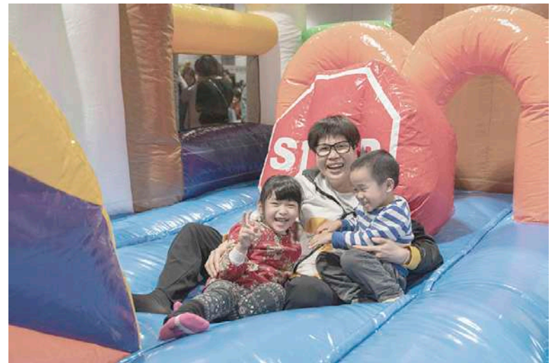
Special Cares Network Carnival in Macao