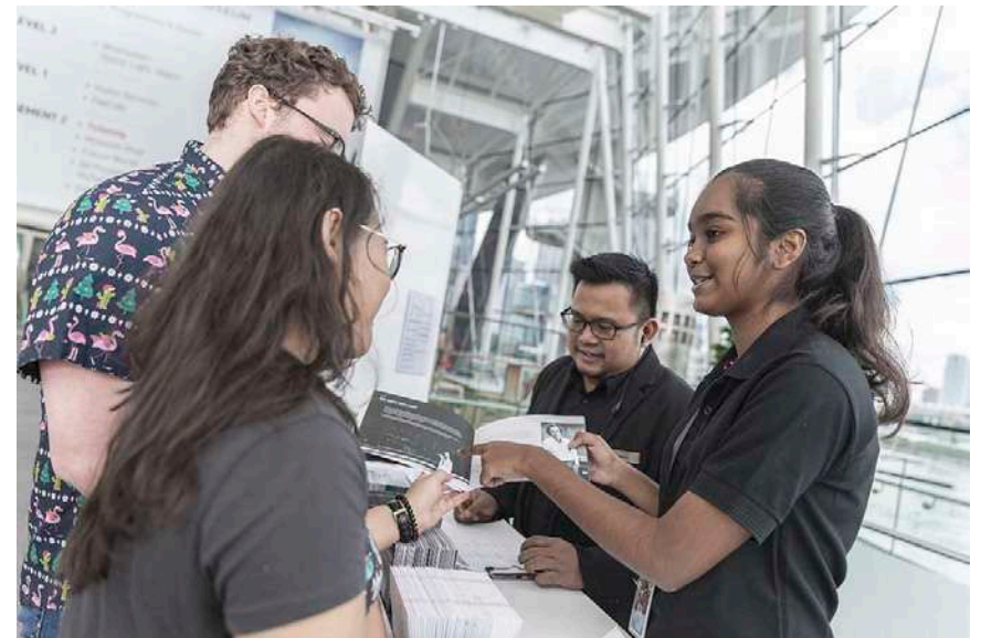
Heartware Network Apprenticeship Program - ArtScience Museum, Singapore

Marina Bay Sands provides opportunities for Singaporean students interested in the hospitality industry through the Heartware Network Apprenticeship Program, which gives youth from low-income families greater exposure to the hospitality industry and helps them gain communication and life skills. In 2019, 15 students from six different schools completed the two-week program with the property's ArtScience Museum and the attractions and retail departments. In addition, the Marina Bay Sands Bursary supported 20 full-time hospitality business students from the Singapore Institute of Technology.