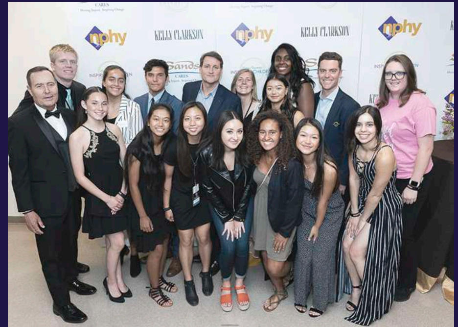
Youth and representatives from the Marty Hennessy Inspiring Children Foundation attend the 2019 Sands Cares INSPIRE Charity Concert, benefiting Sands Cares Accelerator members.