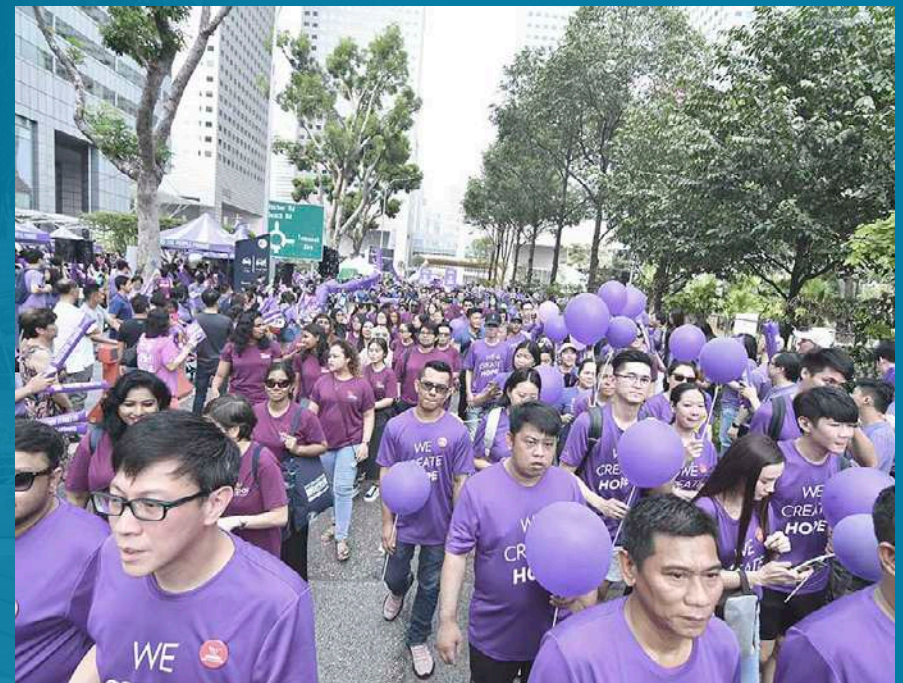
Marina Bay Sands Team Members participate in The Purple Parade, Singapore.

In Las Vegas, The Venetian Resort Las Vegas partners with Nevada Partnership for Homeless Youth on the Young Achievers Externship Program , a one-year, paid internship that is awarded to a Nevada Partnership for Homeless Youth client. The internship includes mentoring, training and development, along with the opportunity for sustained employment after the internship concludes. Marina Bay Sands organizes the annual Sands for Singapore Career Kickstarter program, with the goal of inspiring youth to overcome their perceived limitations and expose them to the different career options available at an Integrated Resort. In 2019, the resort hosted more than 60 youth for a day of tailored workshops, educational tours and dialogue sessions with teams from marketing and hotel operations.