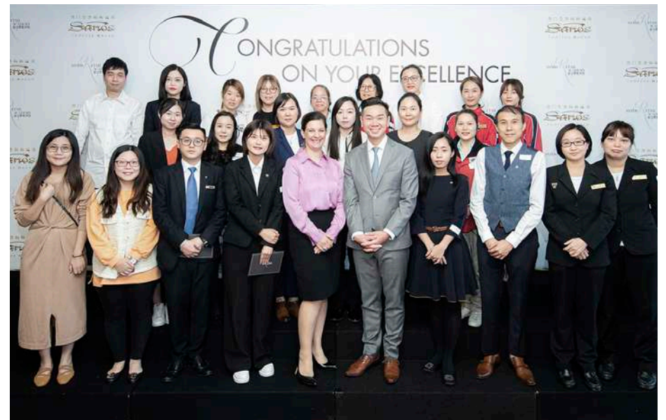
Sands Retail Academy - Sands Shoppes Macao

Sands Academy provides innovative learning and consulting solutions that enable the company to execute its business strategy, while fostering personal and professional growth for Team Members. Our ultimate goal is to be the employer of choice for talent all over the world.